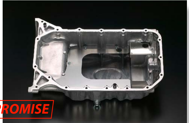
Anti G force oil pan K20A DC5/EP3